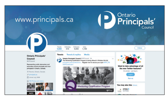
OPC Twitter (@OPCouncil)