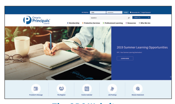
The OPC Website