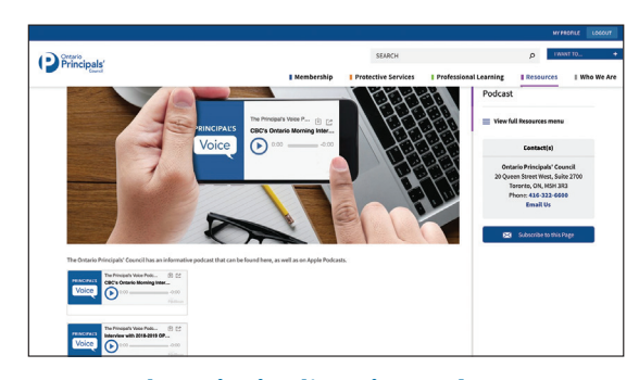
The Principal's Voice Podcast