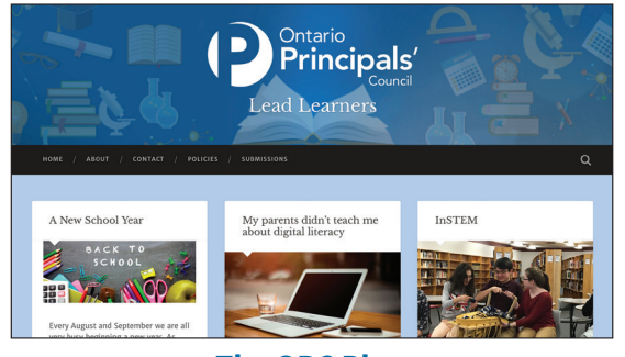
The OPC Blog